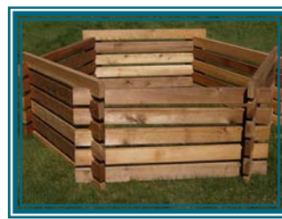
Stack all the side rails to complete the frame