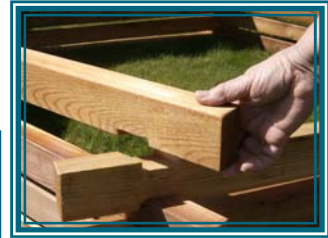
Interlock the side rails together like a little log house