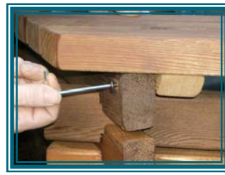
Place pre-assembled benches on top - secure with 2 bolts at each end