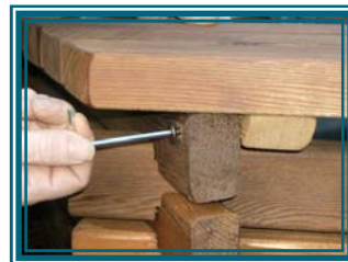
Place pre-assembled benches on top - secure with 2 bolts at each end