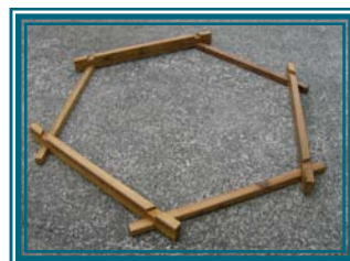
Lay out the base rails where you want your pond

Our ponds set up above ground - no digging required